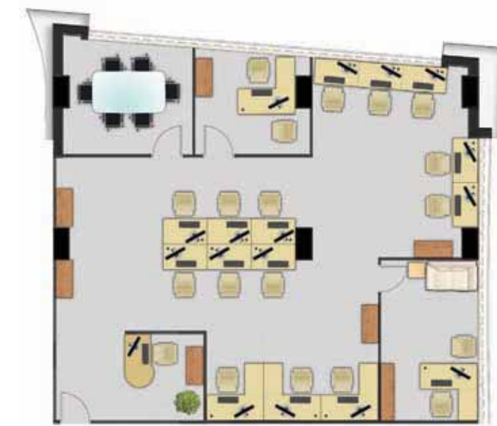
Office 03 Total area : 1,817.97 sq.ft