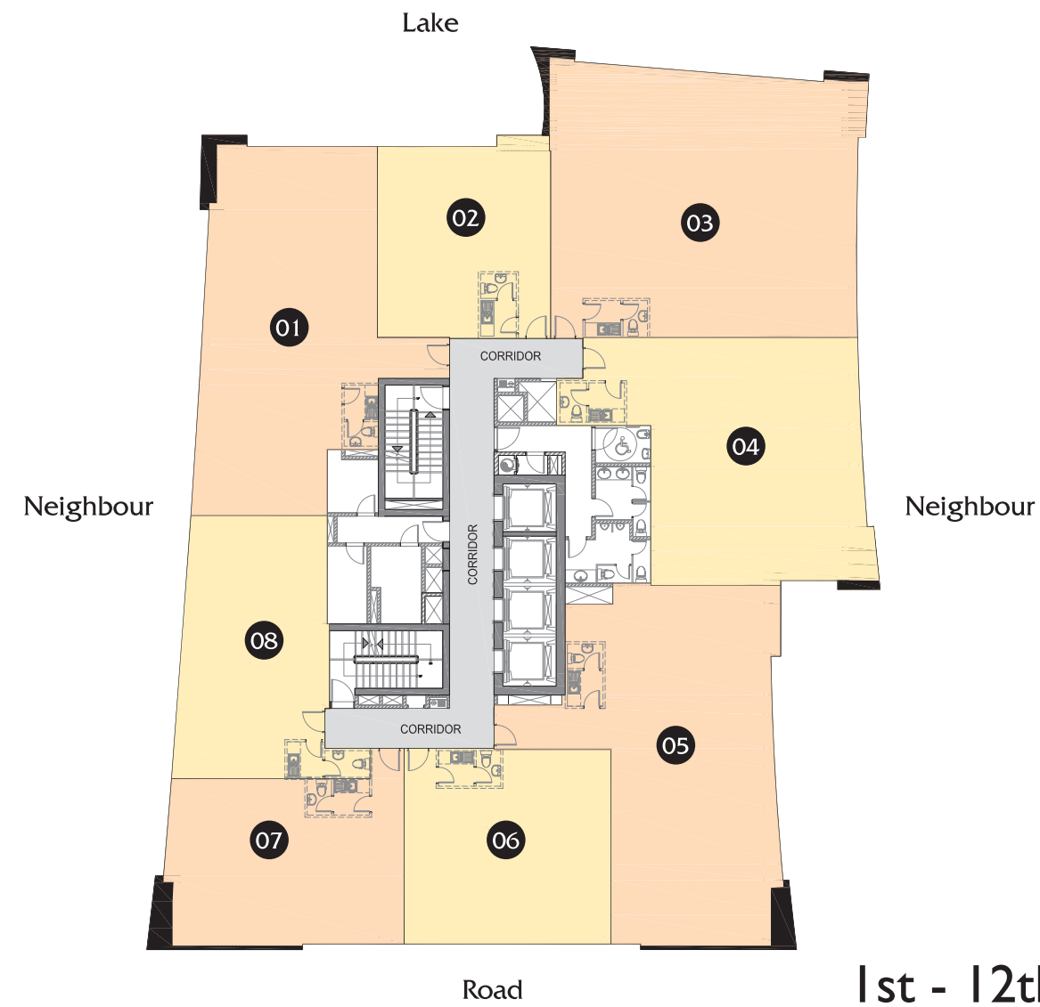
1st - 12th Floor Plan